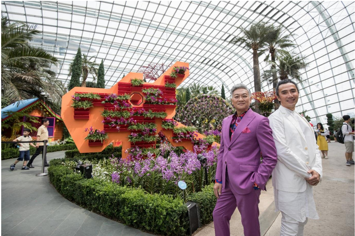
(L-R) Dick Lee and Yang Derong at Orchid Extravaganza

This year's Orchid Extravaganza celebrates Singapore's pop culture with a creative spin on familiar icons, as seen through the eyes of multi-talented Singaporean singer-songwriter Dick Lee. Melding floral artistry and pop art, the orchid display features landmarks and objects that have become part of local culture. From housing to recreation and food, these have been given a playful makeover under the creative direction of Dick Lee and designer Yang Derong, to reflect Singapore's unique blend of tradition and modernity. They stand out amidst a colourful landscape of over 15,000 orchids, comprising more than 80 varieties including heritage orchids such as Aranthera Anne Black, Aranda Bertha Braga and Dendrobium Tay Swee Keng.