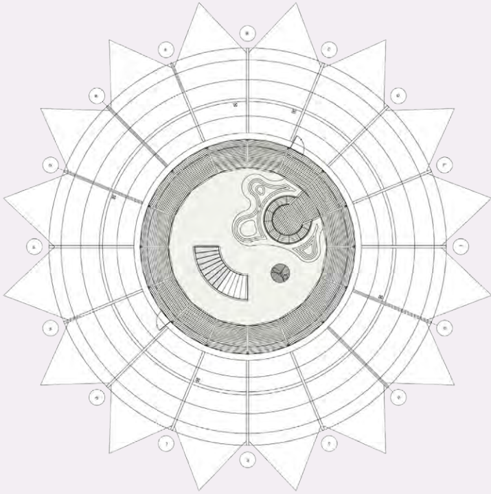
LEVEL 4 PLAN (ROOF TOP)